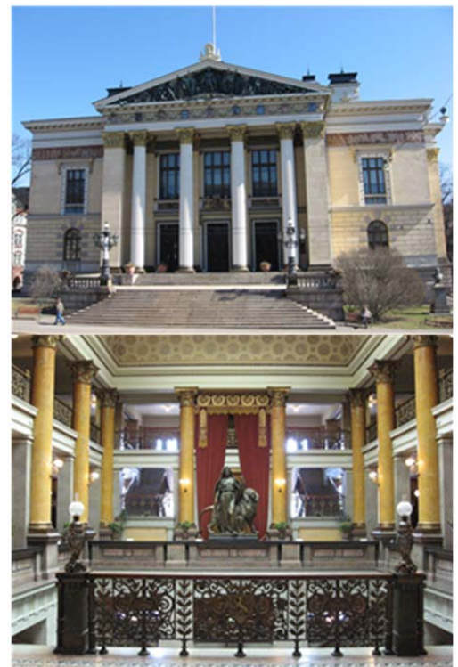
Conference dinner is arranged at the House of the Estates

For the Finnish participants, registration fee includes full registration to the Finnish Bridge Days 2013